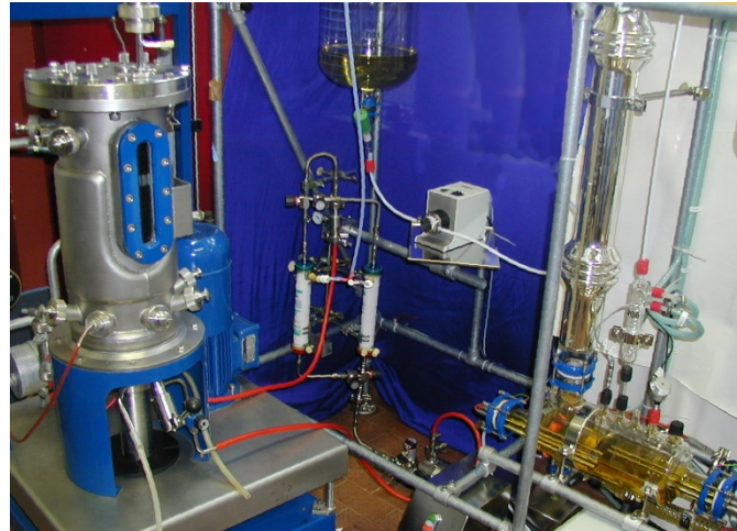
Fig. 1. Miniplant for 1,3-propanediol production

In first tests the bioconversions could already successfully be combined with ultra filtration for biomass separation instead of centrifugation as former published (Grothe 2000). In this way even proteins could be removed, thus minimizing the foaming effect in later evaporation/ rectification.