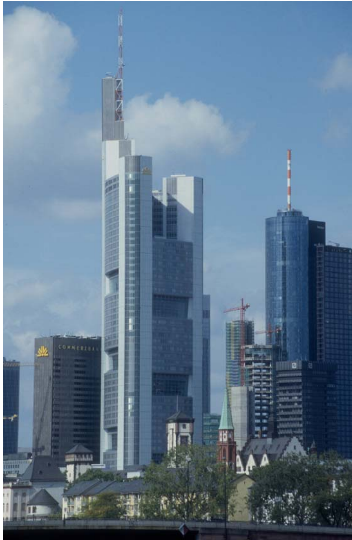
Bild 2.1 Commerzbank Tower