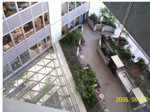
Bild 2.4 Sky Garden

Sir Norman Foster envisaged the gardens as being more than mere decoration. In fact, the generous gardens are a fundamental element in his conception.